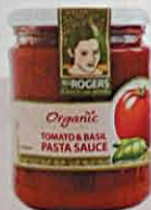
Mrs Rogers Organic Tomato & Basil Pasta Sauce, 430g, $6.75.

Chunky vegetables throughout, but this smells vinegary and tastes acidic.